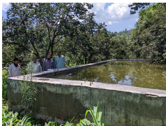
Figure-3.11: Monitoring of Fazal Maula Water Pond (Aligram Matta, Swat)