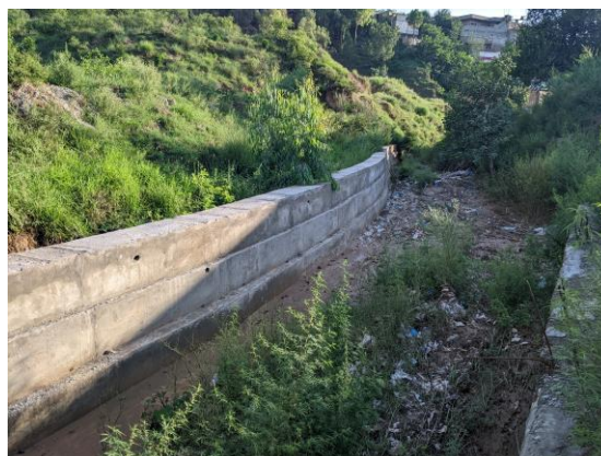
Figure-3.3: Monitoring of Mian Syed Bashar SBS (Panr Mingora, Swat)