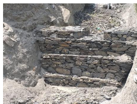
Figure-3.32: M. Wali Shah Check Dam (Chamarkand Chitral)