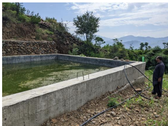
Figure-3.22: Monitoring of Bakht e Rahman Water Pond (Koza Bakhel Kabal, Swat)