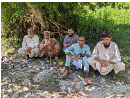
Figure-3.14: Interviewing the beneficiary of Abdul Jabbar SBS (Barawal Matta, Swat)