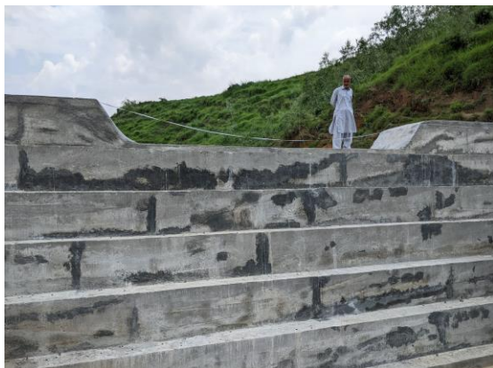
Figure-3.27: Monitoring of Mubarak Zeb Check Dam (Adenzai, Dir Lower)