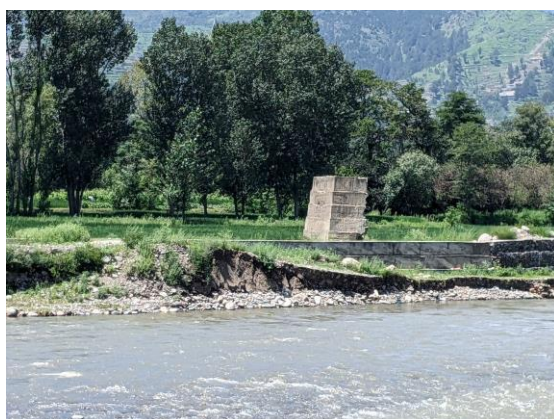
Figure-3.6: Monitoring of Ashraf Ali SBS (Panr Matta, Swat)