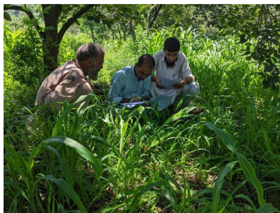
Figure-3.12: Interviewing the beneficiary of Fazal Maula Water Pond (Aligram Matta, Swat)