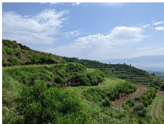
Figure-3.21: Monitoring of Bakht M. Terracing (Koza Bakhel Kabal, Swat)