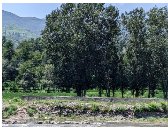
Figure-3.8: Monitoring of Anwar SBS (Panr Matta, Swat)