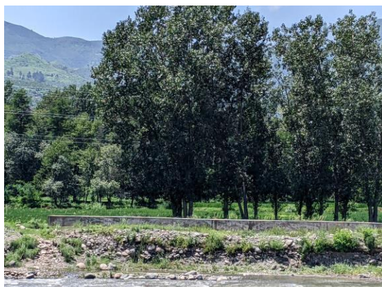
Figure-3.5: Monitoring of Abdullah SBS (Panr Matta, Swat)