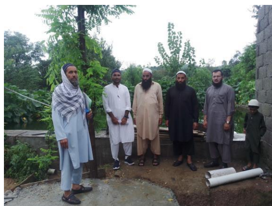
Figure-3.35: Abdul Waheed Water Pond (Abbottabad)