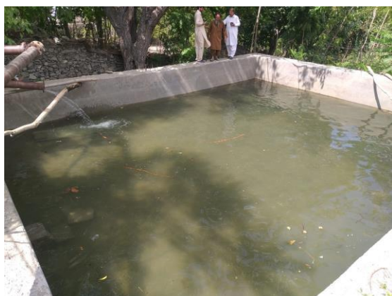
Figure-3.29: Monitoring of Abdul Haye Water Pond (Orghosh Chitral)