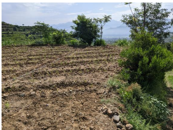
Figure-3.20: Monitoring of Bakht M. Terracing (Koza Bakhel Kabal, Swat)