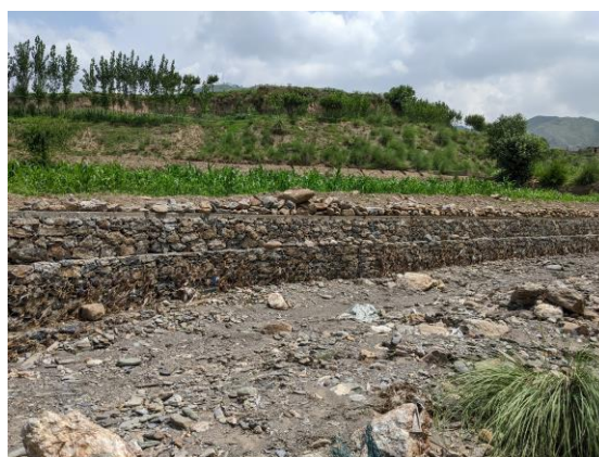
Figure-3.26: Monitoring of Rehman ud Din SBS (Adenzai, Dir Lower)