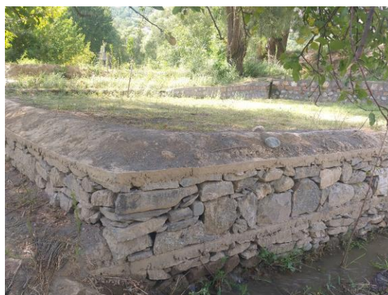
Figure-3.28: Monitoring of Sibghat Ullah Terracing (Ayun Chitral)