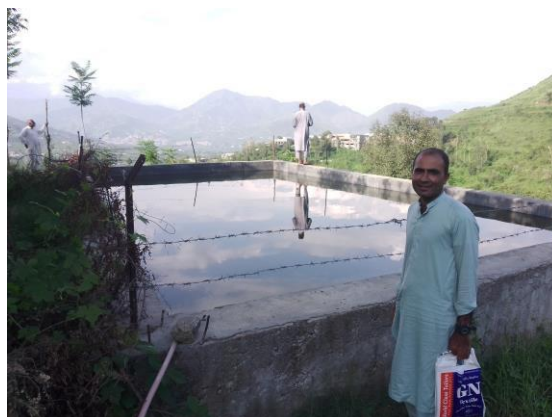
Figure-3.18: Monitoring of Bashir Water Pond (Barrawal Matta, Swat)