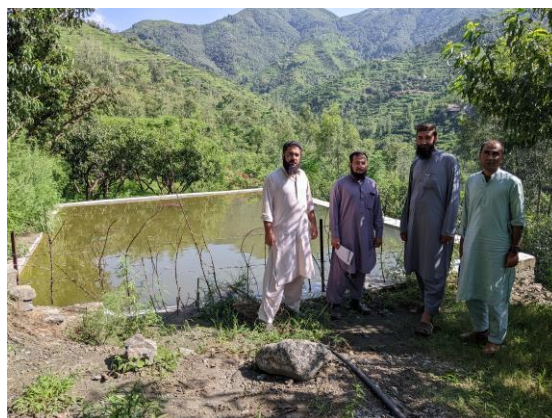
Figure-3.15: Monitoring of Fazal Ghaffar Khan Water Pond (Barawal Matta, Swat)