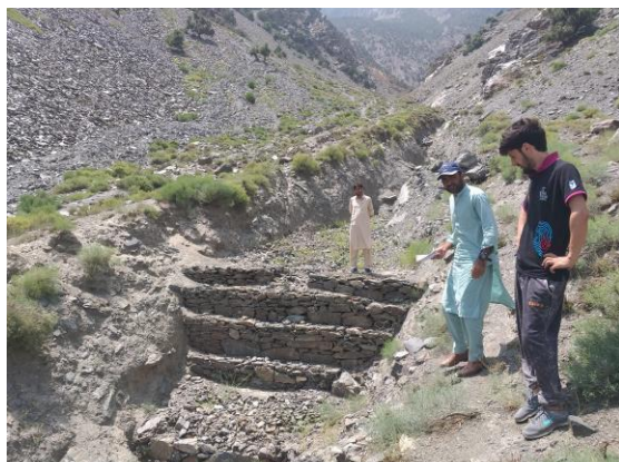
Figure-3.33: Maqsood Check Dam (Orghosh Chitral)