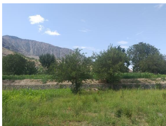
Figure-3.30: Monitoring of M. Aslam SBS (Danin Chitral)