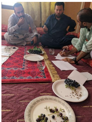
Figure-3.2: interviewing the beneficiary of Shakerullah Water Pond (Babuzai, Swat)