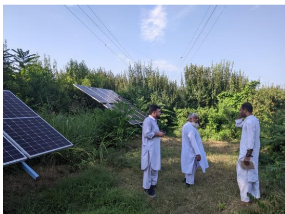
Figure-3.25: Monitoring of Fazl e Akbar Tube Well and Solarization of Tube Well (Barikot, Swat)