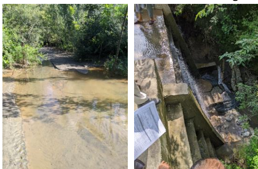
Figure-3.17: Upstream and Downstream of Fazal Wahhab Check Dam (Barrawal Matta, Swat)