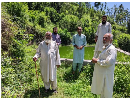
Figure-3.9: Monitoring of M. Salar Water Pond (Katelai Chuprial Matta, Swat)