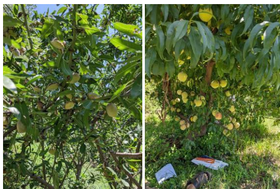
Figure-3.10: Orchards of Peach and Almond in the command area of M. Salar Water Pond (Katelai Chuprial Matta, Swat)