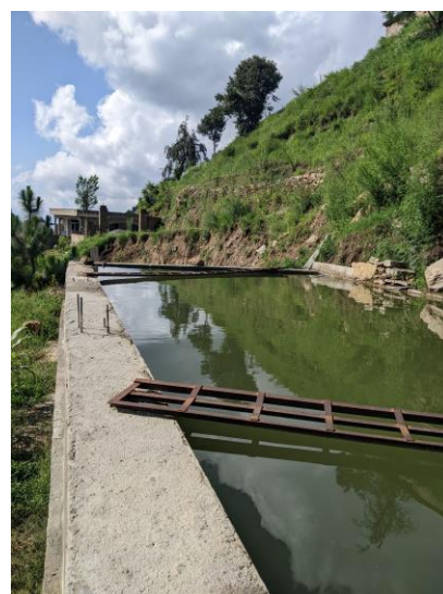
Figure-3.1: Monitoring of Shakirullah Water Pond (Babuzai, Swat)