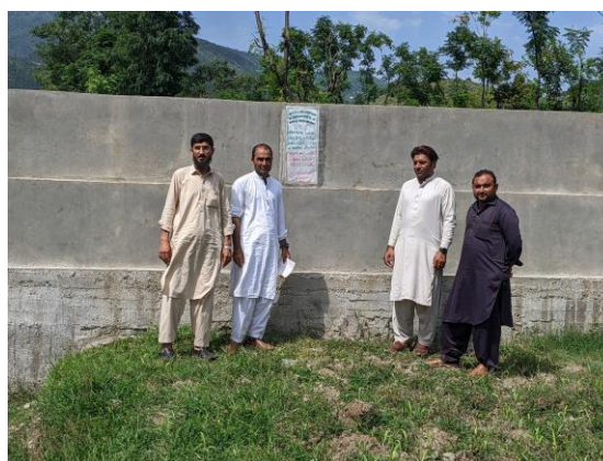
Figure-3.24: Monitoring Sardar Hussain Water Pond (Kabal, Swat)