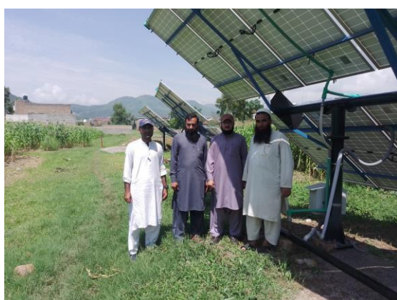
Figure-3.34: Jehanzaib Tube Well & Solarization (Havalian, Abbottabad)