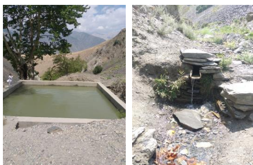
Figure-3.31: Monitoring of Asad Ali Water Pond (Chamarkand Chitral)